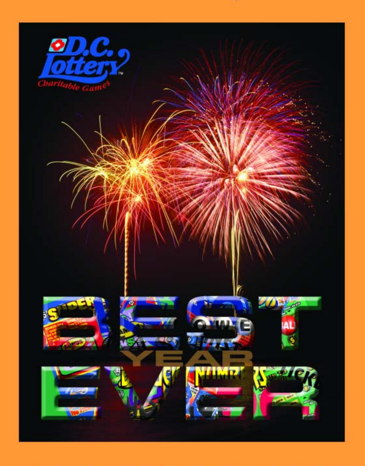
D.C. Lottery and Charitable Games Control Board