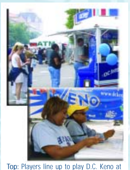
the Taste of DC festival. Bottom: D.C. Keno players at the Taste of DC.

May 2003 live on Fox 5 Morning News with additional media coverage throughout its initial day of operation. D.C. Keno is a fast-paced game with drawings every four minutes. Players have an opportunity to win a range of prizes up to $100,000 per draw by matching some, all, or none of the 20 spots (numbers) drawn for every game. "Play D.C. Keno, It's Time," was